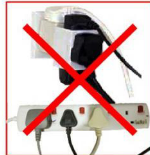
NO MULTIPLE SOCKET/ OWN EXTENSION