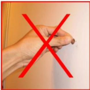
NO THUMB TACK