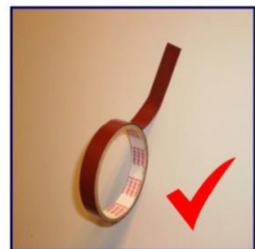
ACRYLIC DOUBLE TAPE