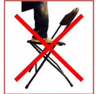
NO STEPPING ON CHAIR